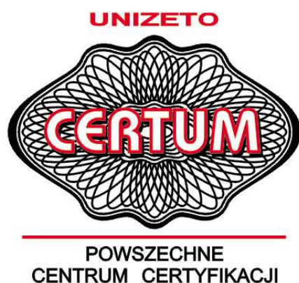
Fig. 9.1 CERTUM Logo

Unizeto Technologies S.A. owns registered trade mark, consisting of graphic mark and inscription, which constitute the following logo: